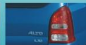
Sparkling Tail Lamps

MARUTI AUTHORISED DEALERS: AALIANZ AUTOMOBILES Ph.: 011-26104693, 26183785, APRA AUTO (INDIA) PVT. LTD Ph.: 011-42390000, 41009900, J BAGGA LINK MOTORS (P) LTD Ph.: 011-22169111, 22169555, J COMPETENT AUTOMOBILES CO LTD Ph.: 011-26917814, J COMPETENT AUTOMOBILES CO LTD Ph.: 011-23355285, 86,87, 23328009, J COMPETENT AUTOMOBILES CO LTD Ph.: 011-25925261, 25925329, COMPETENT AUTOMOBILES CO LTD Ph.: 011-22446551, 22217774, J D D MOTORS Ph.: 011-41845000, 28116502, J D D MOTORS Ph.: 011-27153999, 41843000, D. D MOTORS PVT LTD Ph.: 011-40523000, FAIR DEAL CARS (P) LIMITED Ph.: 011-22119626/27, 9910894050, J GAUTAM MOTORS PVT LTD Ph.: 011-41613879, 28613879/80, KRISH AUTOMOTORS PVT LTD Ph.: 011-32435050, J MAGIC AUTO Ph.: 011-25397777, MARKETING TIMES AUTOMOBILES PVT. LTD Ph.: 011-2629 2629, MARKETING TIMES AUTOMOBILES PVT. LTD Ph.: 011 : 25112222, MARUTI SERVICE MASTER Ph.: 011-41612194, 41612195, J PASCO AUTOMOBILES Ph.: 011-25963535, RANA MOTORS PVT LTD Ph.: 011-26712222, J RANA MOTORS PVT LTD Ph.: 011-23972222, J ROHAN MOTORS LIMITED Ph.: 011-41679303-04, 41678695-97, J SAYA AUTOMOBILES LTD Ph.: 011-27231955-57, 27251402/03, SIKAND and COMPANY Ph.: 011-23320450, 23310364, J T R SAWHNEY MOTORS PVT LTD Ph.: 011-22816777, 22816533, T R SAWHNEY MOTORS PVT LTD Ph.: 011-27853094,