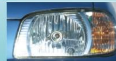
Clear Lens Headlamps