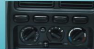
Rotary Control for AC*