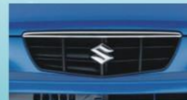
Dynamic Front Grill and Bumper