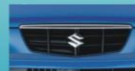
Dynamic Front Grill and Bumper