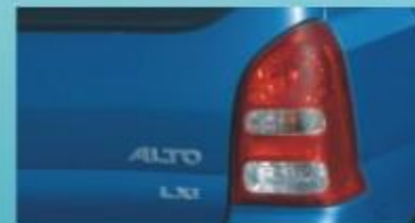
Sparkling Tail Lamps