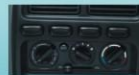
Rotary Control for AC*

Accessories and coloured bumper shown are not part of standard equipment. *Feature available in LX and LXI variant. http://marutialto.com