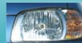
Clear Lens Headlamps